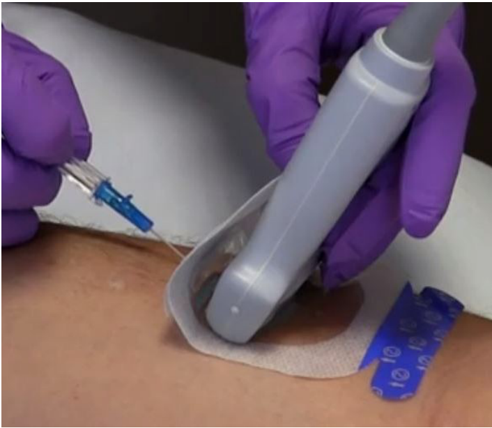
Figure 3: Representative photo illustrating UGPIV catheter insertion with sterile transparent barrier and securement dressing.

The final analysis of probe protection using the transparent barrier dressing versus the sterile probe sheath cover reported a preference for the transparent barrier dressing at 97.5% and a recommendation for the adoption of this standardized procedure and probe protection at 99.5%.