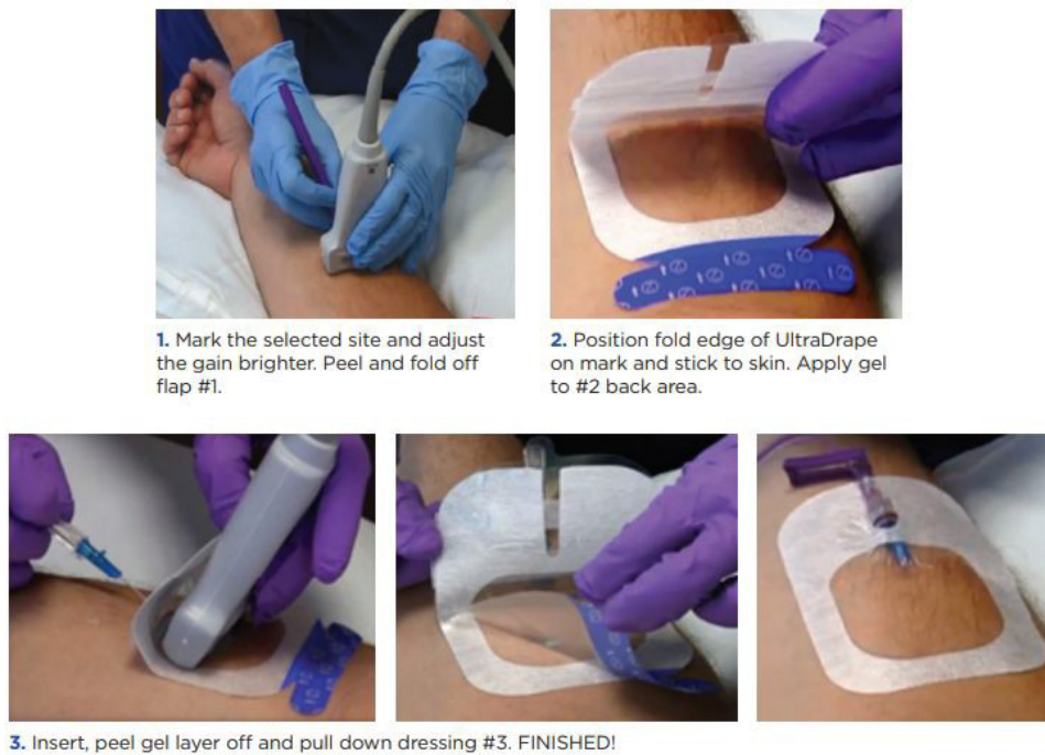
Figure 1: The 1-2-3 procedure for applying the sterile transparent barrier and securement dressing for probe protection.

Data were collected over five weeks, from April to May 2019, using a validated Likert study tool on the Survey Monkey website (Momentive Inc., One Curiosity Way, San Mateo, CA 94403, USA). The study tool was validated through a five-clinician feedback review performed at a Northeastern medical center. Data included facility location, the type of catheter device inserted for each procedure, and tool completion by the clinicians for each question listed in the tool. No personal medical information was collected for the patients in the UGPIV insertion procedures. Data from the clinician feedback was stored in a secure database and maintained for the required years.